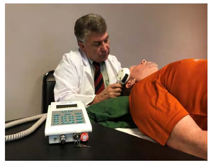
Figure 2. Patient being treated for ADHD utilizing the Theralase TLC 1000 super-pulsed laser.

schedule and my thoughts to accomplish simple tasks It was suggested I go to the Brain Center where a good friend of mine had their three young boys treated. They were all in their twenties and they were able to focus much better after a single 5-minute treatment. I received two treatments consecutively due to the fact I had to leave town. I'm not sure I even needed the second because the initial treatment gave me the clarity and focusing ability which was necessary to be more efficient in my everyday activities. I have just started a new job where I am now taking on a new task and use a new program. I know this would have been much more challenging then it would have been before the therapy."